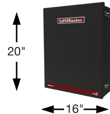
XLSOLARCONTDC Extra Large Control Box

* Basic set up with remotes programmed. Does not include added accessory power draw. LiftMaster low power draw accessories recommended to extend cycles and standby time on battery backup.