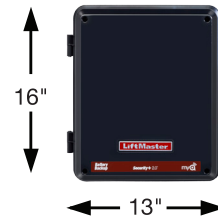
LA400CONTDC Standard Control Box