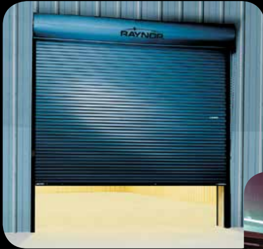
DuraCoil™ gray, with flat steel slats