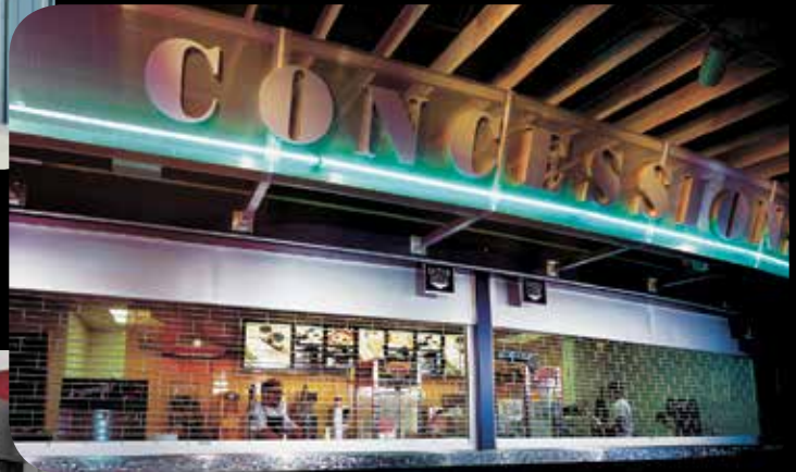
DuraGrille™ brick pattern